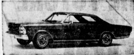
1966 FORD GALAXIE '500'