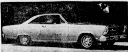
1966 FAIRLANE '500'