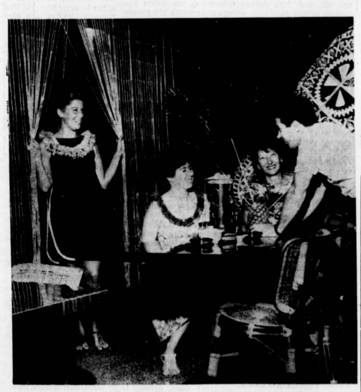
Go-Go Hawiian Style

of the many beautiful horses entered in the National Horse Show Benefit at Los Alamitos Race Course, Sept. 10-12, sponsored by the Auxiliary of the Long Beach Community Hospital.