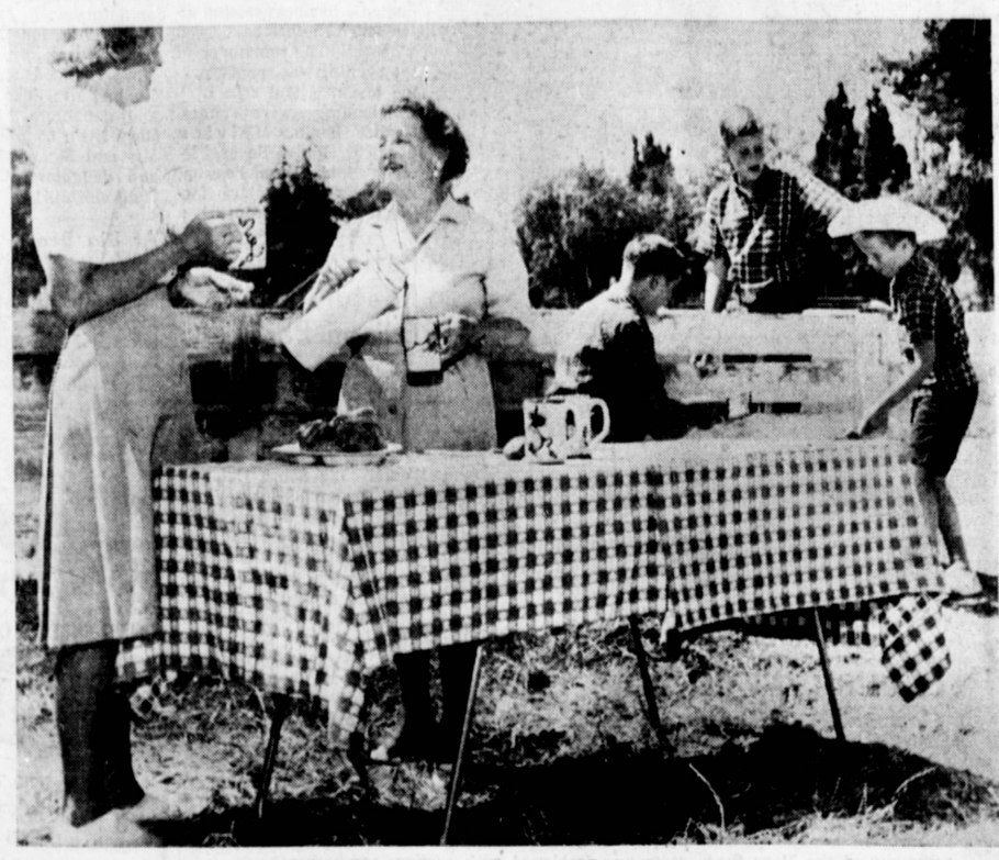
As Show Time Draws Near

Husbands and children of committee members are busy freshening up the area in preparation for the show. They are painting and repairing fences and raking the courtyard and gardens. Feeding the crews of workers are committee members who set