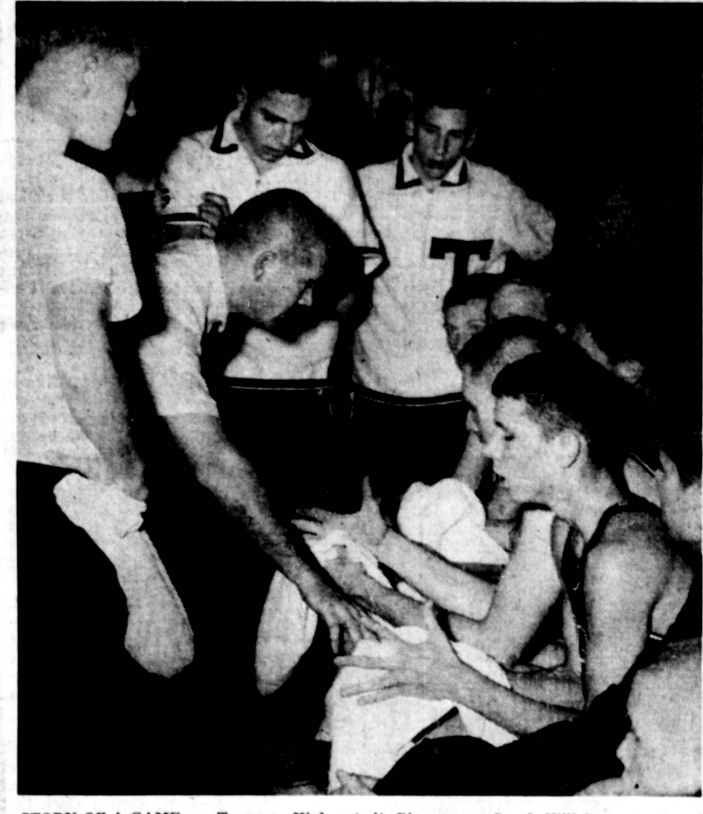
STORY OF A GAME . . . Torrance High gots its Pioneer League basketball campaign off to the best sort of start Friday by defeating West, 70-50, at the Tartar gym.