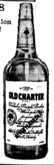
"Tick-tock... tick-tock... the Bourbon that didn't watch the clock for seven long years!"