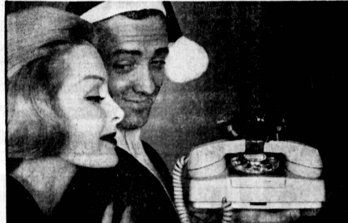
Light up her Christmas with a Starlite phone

Always a phone at hand in a home that's Telephone-Planned!