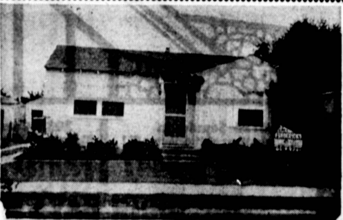
TWO ON A LOT

Full price only $33,000. $3,300 down will handle. Here is the place to start your investment program, build an equity and trade up. Call us today FR 8-8447, ask for No. 292M.