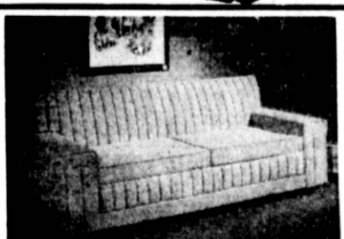
PLUSH SLEEPER SOFA

roomy sofa by day and a comfortable bed at night—genuine Air-foam reversible cushions. Choice of fabrics. Immediate delivery.