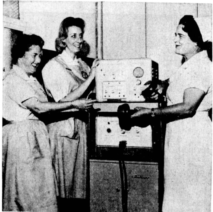
CARDIAC TREATMENT CENTER Women's Auxiliary to the Torrance Me-