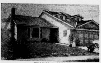
TRULY A HOME

and five custom four unit income buildand nive custom four unit income build-and Paldina are nearing completion. They 170th and 171st Streets east of Yukon in homes boast outstanding construction, with ns, clining rooms and all deluxe features, in be open on the premises. However, call learest you for further details now.