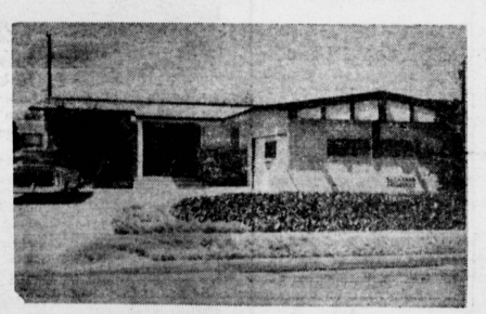
EXECUTIVE HOME AND POOL

Believe it or not, a beautiful 3 bedroom home near shopping and transportation. Only $19,950. Call DA 3-5761. Ask about No. 118M.