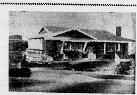
INTRIGUING AND PRACTICAL

In the summer at the beach; is this 3-bedroom home. It has a built-in kitchen with double oven and dishwasher. Interior has just been repainted. The full price is just $22,950. To inspect just call FR 8-8447, ask for No. 202M.