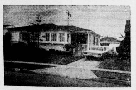
3 BEDIROOM $19,950

Of distinction with light, airy, spacious rooms. Perhaps this 4-bedroom and family room home with 2-boths is what you are looking for. Beautiful landscaping, built-in kitchen, wall-to-wall carpets and drapes. To see call FR 8-8447, osk for No. 229M.