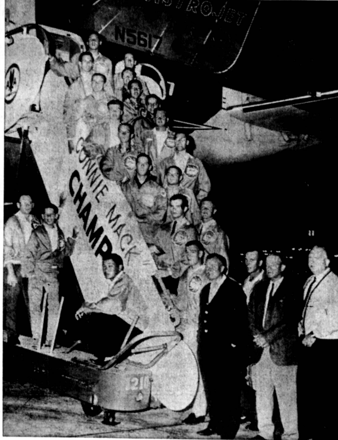
TITLE CONTENDERS . . . The Tordena Bullets, comprised of top horseholders from the Torrance-Gardena area, are shown leaving International Airport Monday for the Connie Mack World Series in Springfield, Ill. As of Friday, the Bullets had won two out of three games in the double elimination tournament.