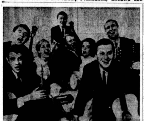
FAVORITES . . . Kingplus of the folk music set, the New Christy Minstrels, join with Arirang, korea's na-tional folk company, to entertain in Greek Theatre be-ginning Tuesday, Sept. 8.