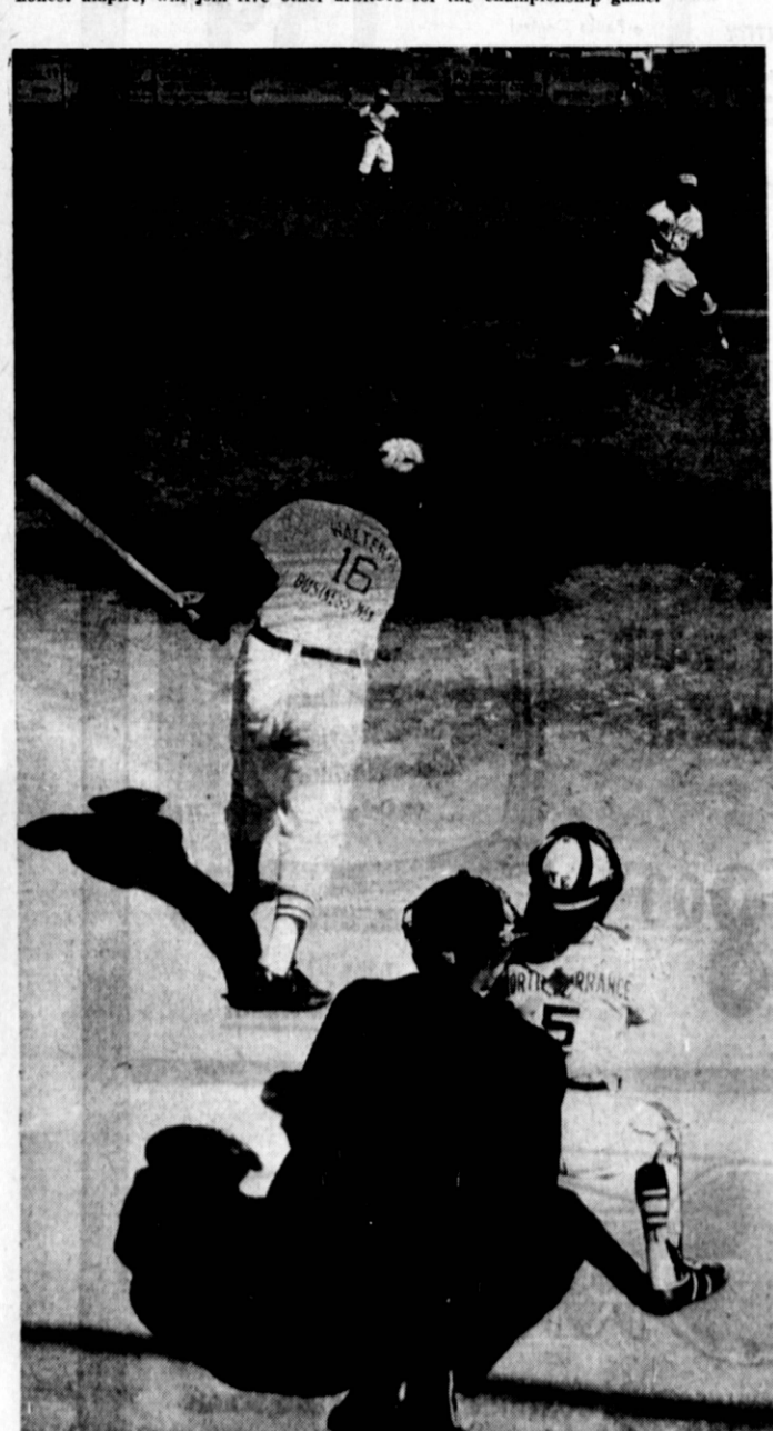
AMERICAN SPORT . . . Two local Little League teams are pictured above attempt ing to battle their way into the Western Regionals, Torrance will not be directly reprasented in the tourney, which begins Thursday at Garrett Field. Games will be played on Thursday and Friday at 5:30 p.m. and on Saturday at 3:30 p.m.