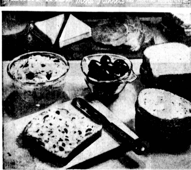
RIPE OLIVES and eggs provide color and flavor appeal in this sandwich spread. Crabmeat takes to sandwiches, too, and recipe for Golden Crab Sandwich is included.