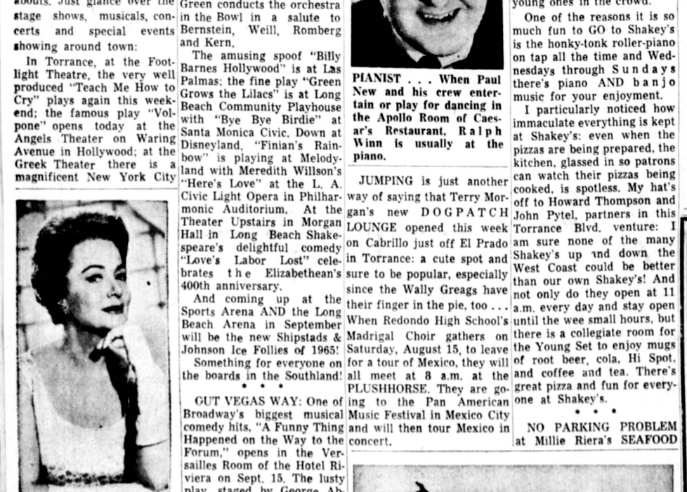
TALENTED ... Lovely "Lady in a Cage," now showing at the United Artists Theater.