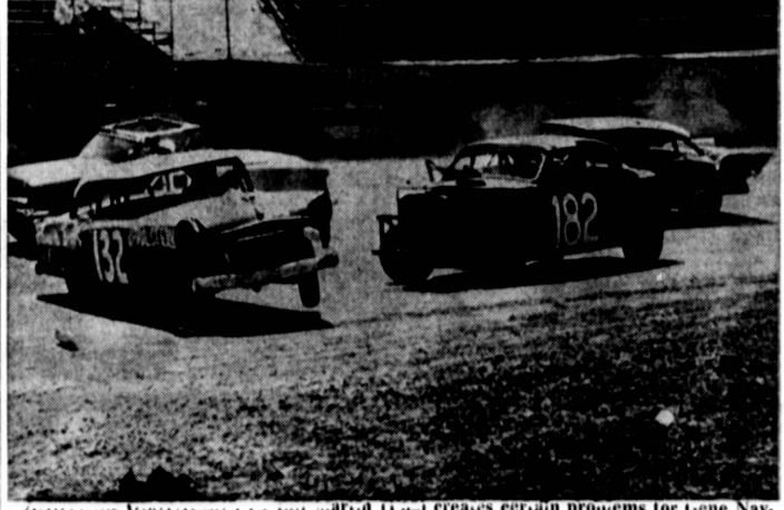
lor (182) in a recent claimer race at Ascot Park in Gardena. More of the same is ex r race at Ascot Park in Gardena. More of the same is ex-California Auto Racing stages a seven-race program for pected this afternoon when California the claimers on the quarter-mile oval.