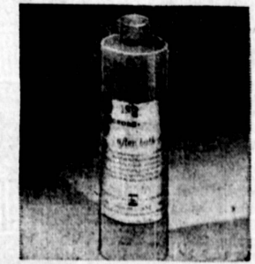
ARCROSS COLD CREAM WITH LANOLIN

Reg. 1.49. In roll-on or plain liquid form, sure action that remains gentle to the skin.