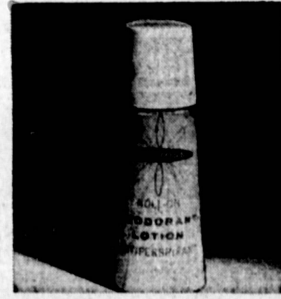
ARCROSS ANTI-PERSPIRANT FOR MEN AND WOMEN

Reg. 99c. Soft to the touch, promises perfect grooming; in regular or hard-to-hold formulas.