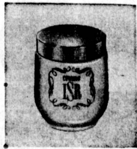
BONNIE BELL'S ISR CREME SPECIAL