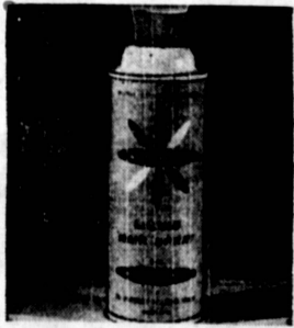
ARCROSS TRANSPARENT HAIR SPRAY

Reg. 1.00 box. Delicately scented with true floral fragrances; individually wrapped in gift box.