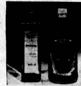
ARCROSS SATIN SMOOTH DRY SKIN BATH OIL

Reg. 1.99. Clean, brisk citrus fragrance is stimulating and refreshing to the body after bath.