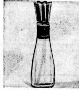
COTY'S SPECIAL VACATION SIZE FLACON MIST

A charming fragrance for a long hot summer. Dusting Powder or Eau de Cologne designed in attractive cut crystal effect. Excellent for that little gift reminder. .... 1.00*