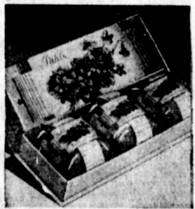
IMPORTED PERFUMED TOILET SOAP

Tweed dusting powder with fluffy puff and gift of Cologne. $4.00 value ..... 2.50* Tweed Cologne with gift of Talcum Powder in shaker, 2.50 value ..... 2.50*