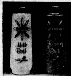
ARCROSS MILK BATH WITH COLD CREAM

Reg. 1.00 Arcross all-purpose cream for deep cleansing; softer for rough skin complexion.