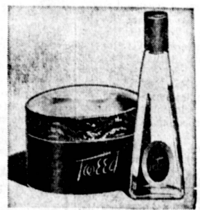
GIFT SPECIAL LENTHERIC'S TWEED

Coty's new Flacon mist—small enough to tuck in your bag . . . large enough to hold hundreds of long-lasting sprays. L'Aimant, L'Origan, Emeraude or Paris 2.00*