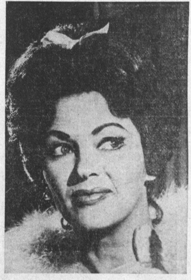
BURKE'S LAW — Yvonne De Carlo stars as Barbara Orazzi, a playgirl countess with a taste for luxurious living. Seen Friday, December 27 at 8:30 p.m.