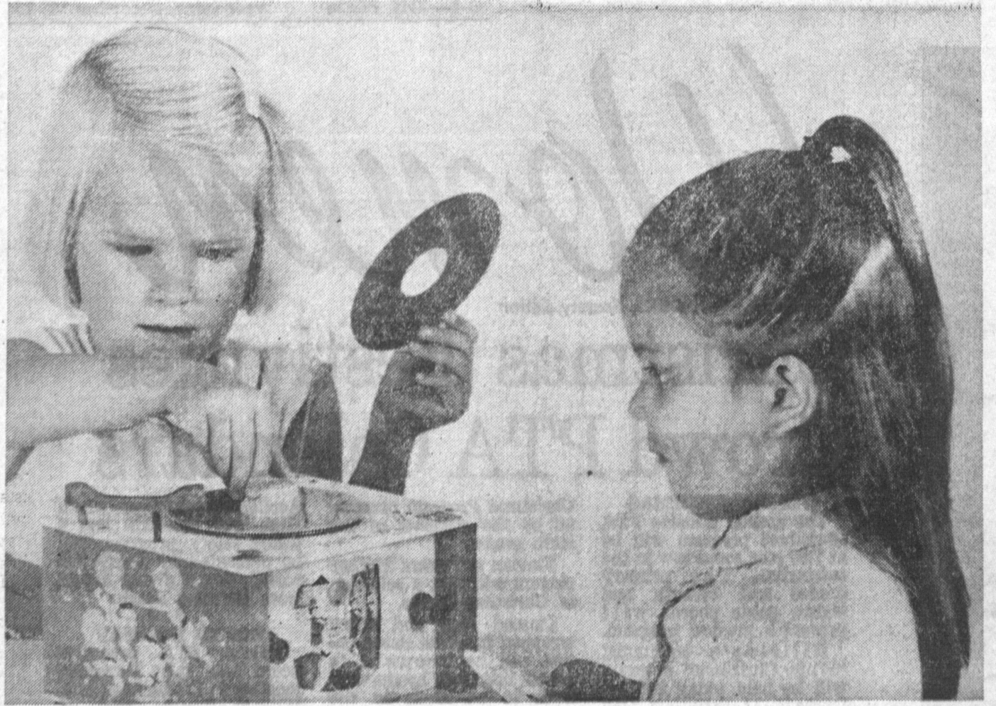
"let's pretend" toy which they may call their own. Imaginative experiences for children.

THE SOUND OF MUSIC. Children are fascinated by When combining both appeals to sight and hearing, music boxes, especially when they are part of a sturdy a toy can be an endless source of repetitive joy and