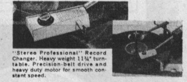
IT'S IMPOSSIBLE TO ACCIDENTALLY RUIN A FINE STEREO RECORD

ZENITH FEATURE 240 WATTS of Peak Music Power