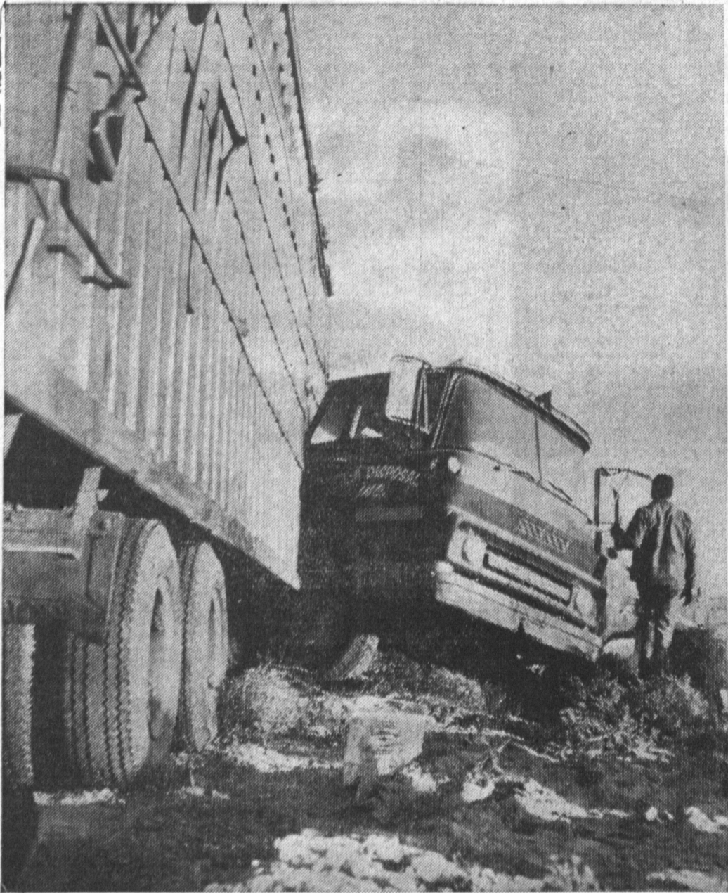
JACKKNIFED trash truck rests on the edge of a field at the corner of Del Amo Blvd. and Hawthorne Blvd. following a near collision Thursday with a passenger car. Driver of the truck told police a vehicle made a sudden

stop in front of him, forcing him to slam on the brakes and swerve to the right. The huge truck knocked down a traffic signal and could not be moved until signal repairmen could remove hot wires. —PRESS photo