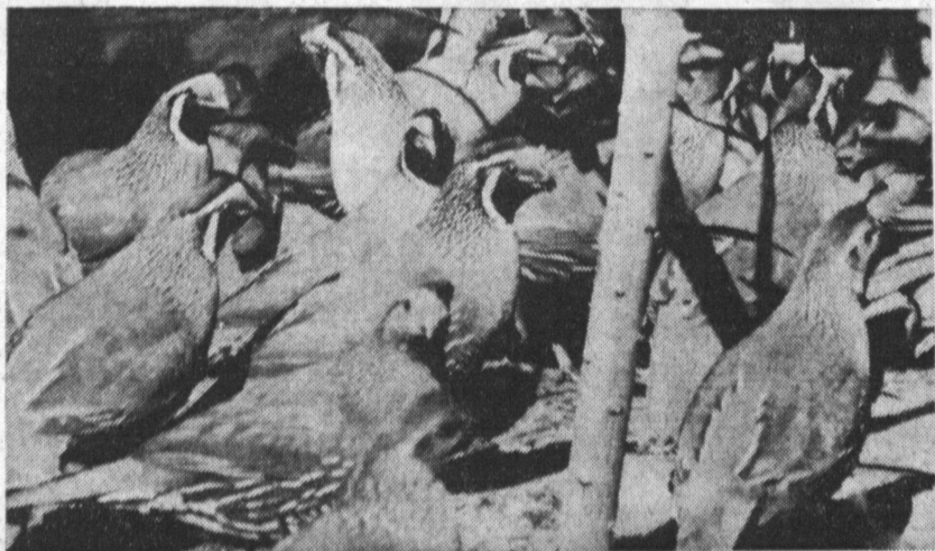
CATALINA QUAIL are on the local island by the thousands this year, ready to give hunters a taste of a unique kind of hunting. There are reported to be more quail per square mile on Catalina than there are on

Accommodation for hunters in Catalina include the Harbor View Inn at Two Harbors at the Isthmus, which is a luxury hunting lodge and everything here is planned for the hunter's comfort, convenience and enjoyment. The lodge provides a warm and friendly atmosphere for after-the-hunt relaxation. Meals at the lodge are served family-style to satisfy man-size appetites.