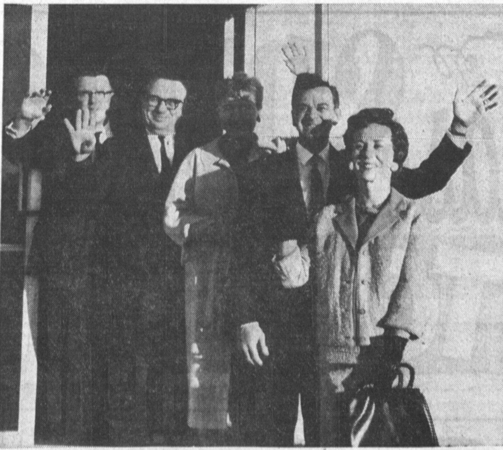
LEAVING FOR Los Angeles International Airport are members of the Torrance-Lomita Board of Realtors.

"This initiative will give Californians the opportunity, through the ballot box, to decide for themselves whether or not they should be deprived of these property rights."