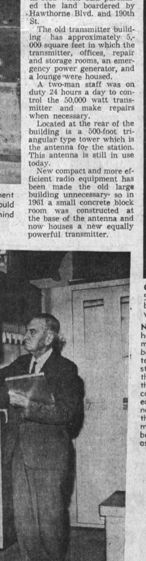
PANEL loaded with dials and knobs that record and KNX. One man now on duty can can perform all the new concrete building which now houses the voice of

ican radio station. New equipment now operating in a new building could be placed on the cement block behind the reporter.