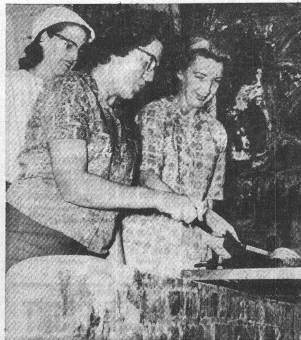
PREPARING TACOS on outdoor fireplace are members of the Dew Drops Patrol who attended training session at Torrance Scout Center, 2365 Plaza del Amo last weekend. Similiar work-