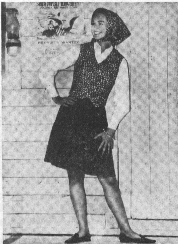
IT'S FALL, THE 'VEST' IS UP TO YOU: No reason this season to look anything but fashion right for dress or play. Here Harburt coordinates several happy conversation pieces. In flannel, shorty wrap skirt with loop patch pockets and tie—both contrast railroad stitched; lined vest in quilted paisley and of course, the ubiquitous long sleeve button-down shirt. FASHION INFORMATION: Skirt—Style 1760, 100% wool. Black, loden, camel, navy, brown, burgundy. Light grey, Char-grey. Retail, about $13. Vest—Style 1572, 100% cotton. Retail, about $10. Both in sizes 7-17/8-18. Shirt—Style 1374, 65% Fortrel polyester/35% cotton. Grey, blue, pink, gold, cream, white, Celery green. Retail, about $6. Skirt and shirt, sizes 5-15/6-18. At better department and specialty stores everywhere. HARBURT, division of Chestnut Hill Industries.