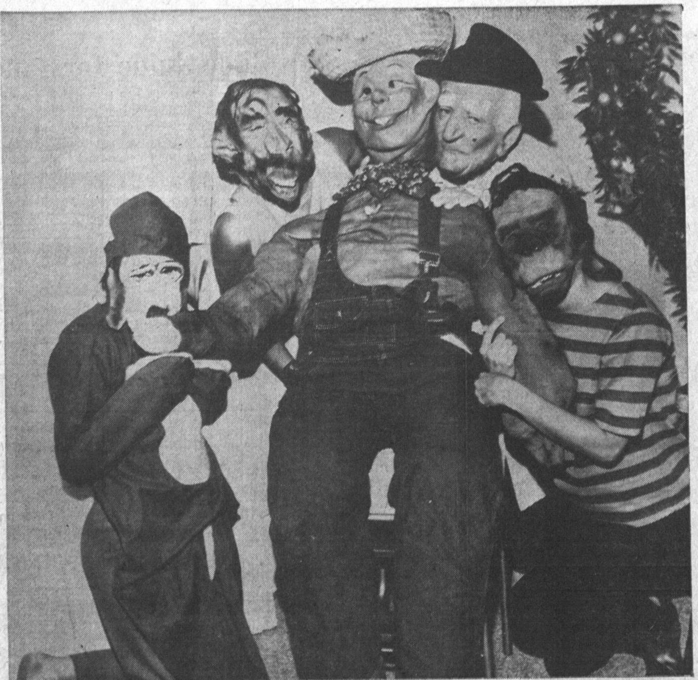
Club. Club members will dress in keeping with their Orman. "secret ambitions" for a Halloween party to be given