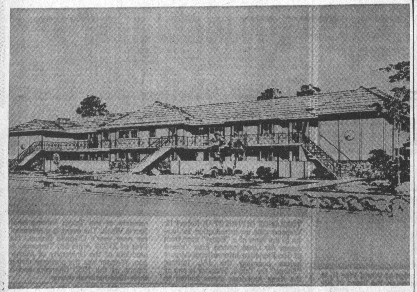
'A TWO-STORY garden home at New Horizons-South nies. There are nine distinctive one and two-story ex-Bay. First story units have fenced patios and garden dining areas. Second story units have private balco-