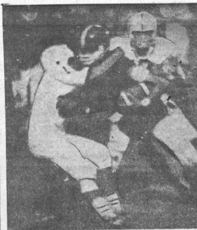
40-0 WAS THE final tally when the gun sounded and Fermin Lasuen defeated South High on the Lasuen field. Lasuen was the CIF AA Champs last year and proved to be too much for the Spartans.

VETERAN POPULATION World War II and Korean conflict veterans total 19.7 million of the 22.3 million current veteran population, the Los Angeles County Veterans Service Office reports.