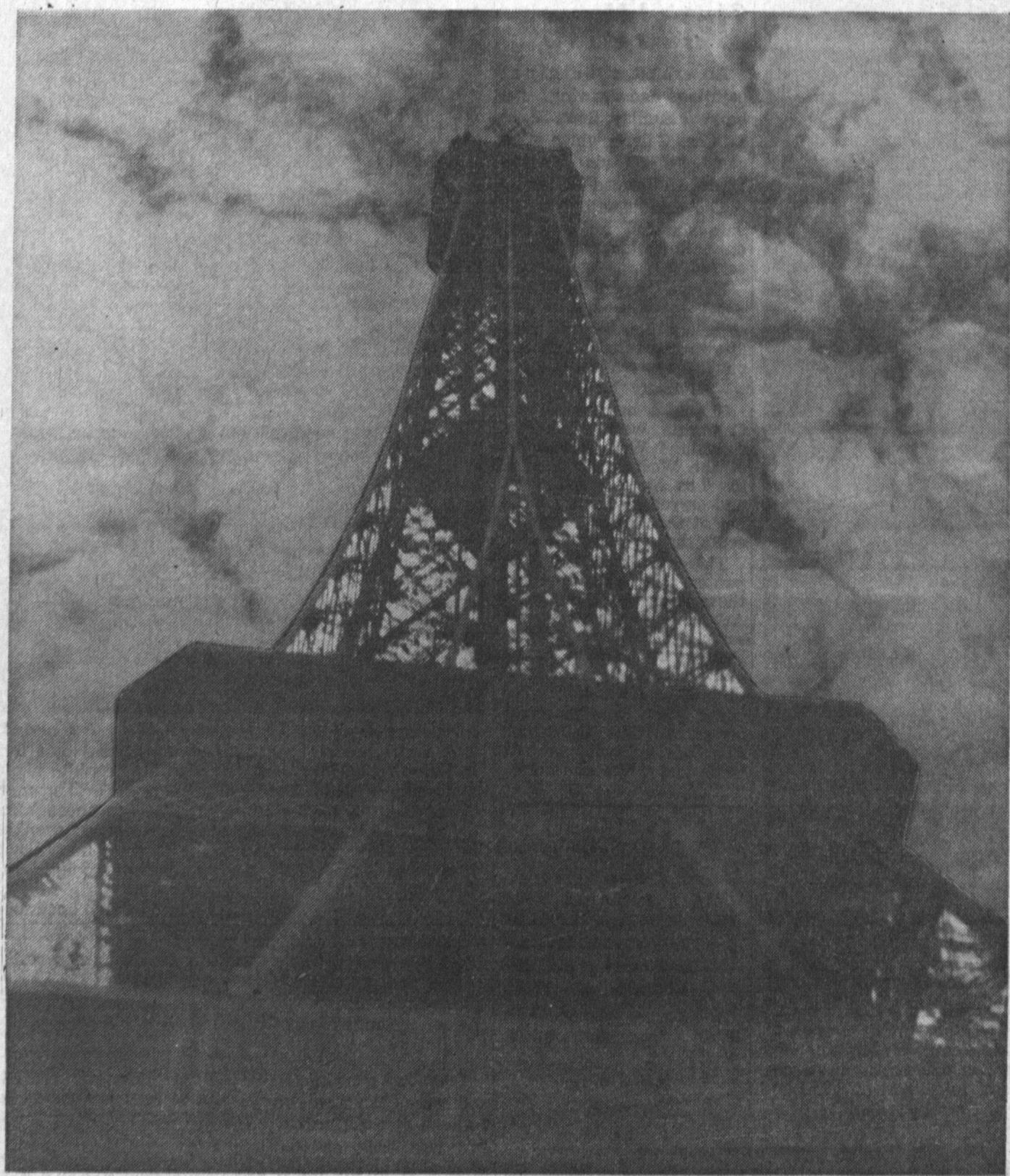
THE EIFFEL TOWER under Paris skies looms high above the gay and enchanting city. The tower is built of skeletal iron and stands a total of 984 feet tall. It was constructed in 1889 for the World's Fair and still reminds Parisians of that era. The view from the