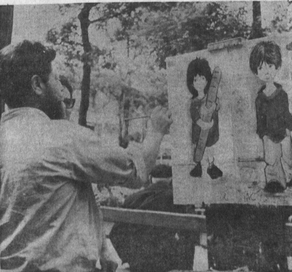
MONTMARTRE, a hillside provincial village within the city of Paris, has two reputations: a noisy night-club center where fashionable revelers