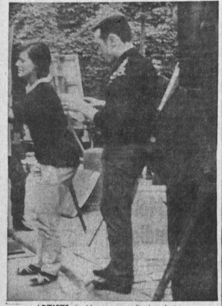
ARTISTS in Montmartre display their art on the sidewalks. Passersby look over the various paintings and sometimes pose on the spot for students. Tourists from all over the world conbe found in this area of Paris.

that are not so familiar to them simply by reading The our readers. Press each Wednesday and But they all have interest Friday.