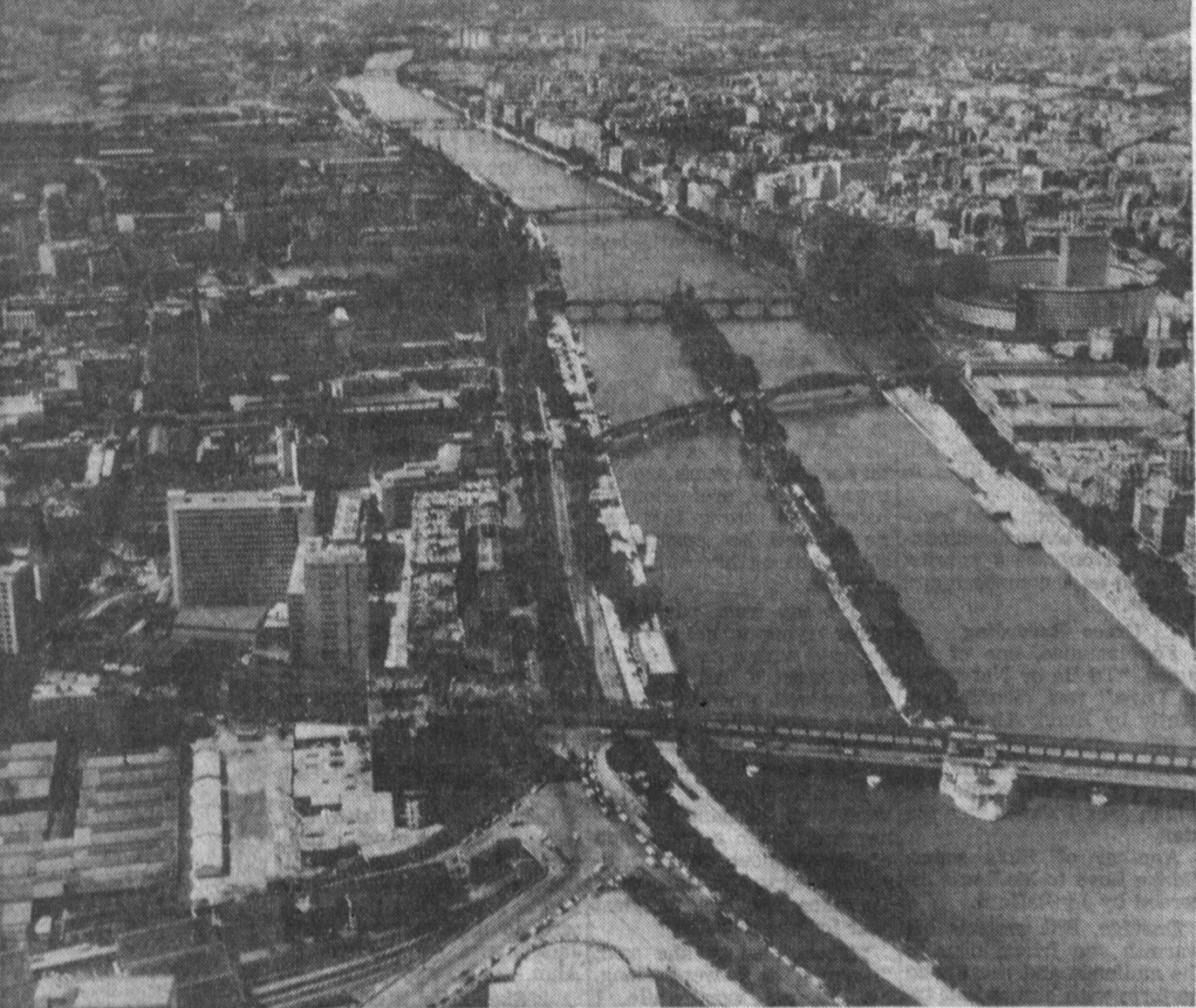
PARIS, the capital of France, is also the capital of the the Eiffel Tower of the magical river Seine. The Seine world to many people. Inexhaustible, the city can truly snakes its way through the heart of Paris and is used claim to be all things to all men. Above is a view from for such pleasures as boating and sunbathing.