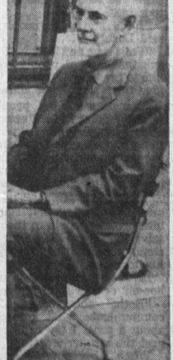
THIS FRENCHMAN sits patiently while his portrait is being painted in the Montmartre district of Paris.