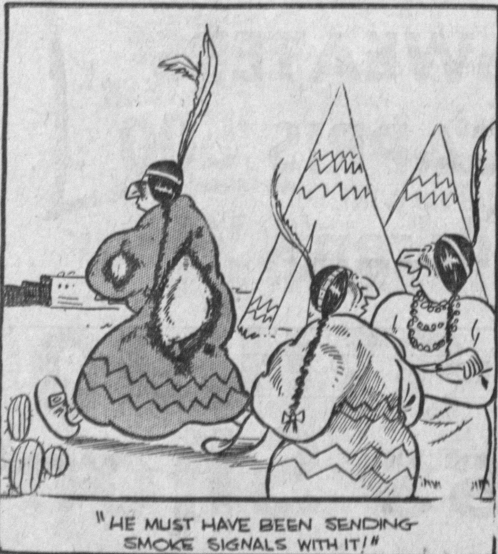
"HE MUST HAVE BEEN SENDING SMOKE SIGNALS WITH IT!"