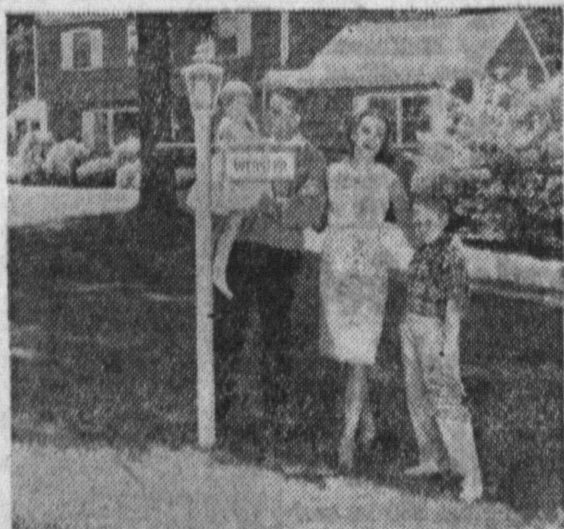
Today savings and loan associations make more than a million home loans a year... more than all other financial institutions combined.