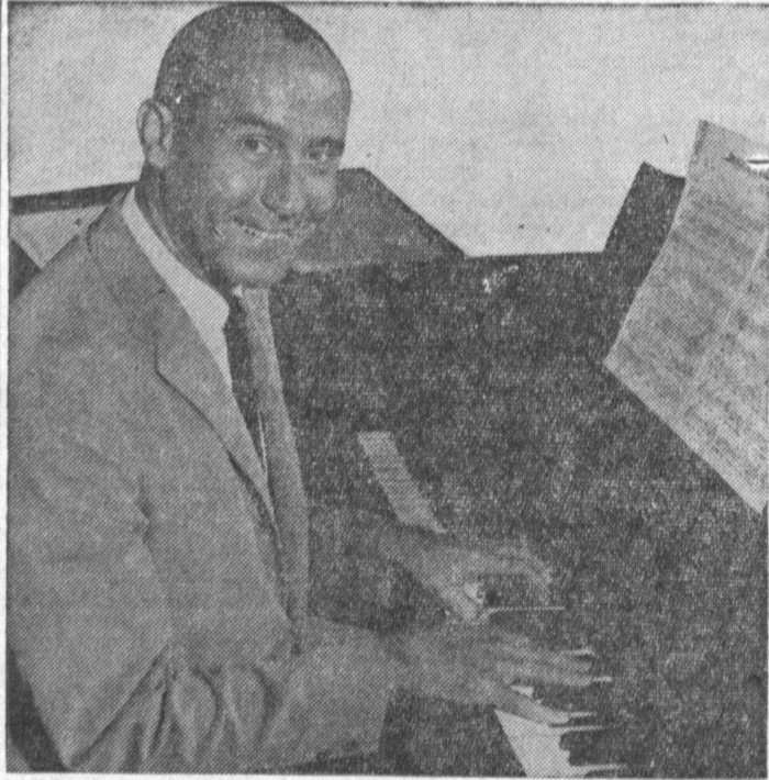
HENRY MANCINI, composer-conductor of musical movie and tv fame, joins with the popular KINGSTON TRIO beginning at the Greek Theater Monday, September 9.