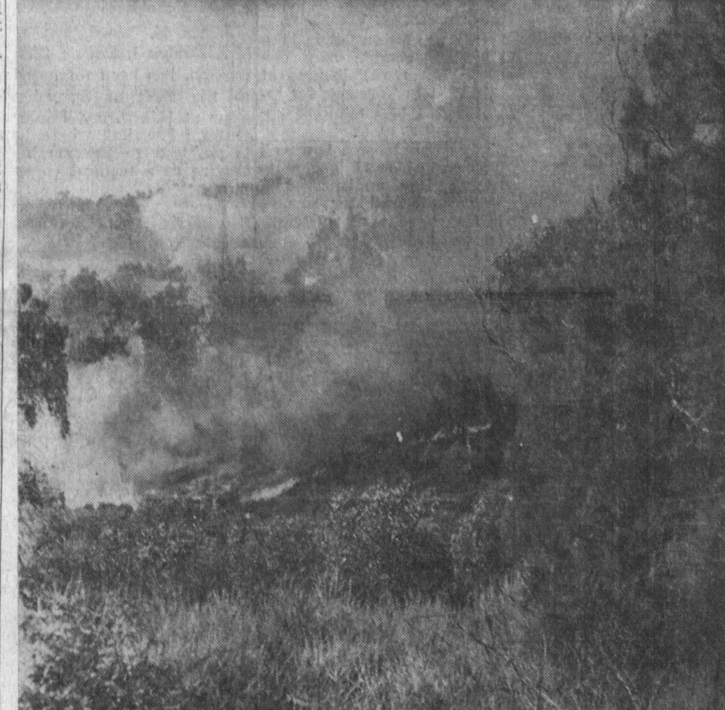
BLACK SMOKE soared skyward from brush fire and attracted automobiles filled with sightseers. Police assisted