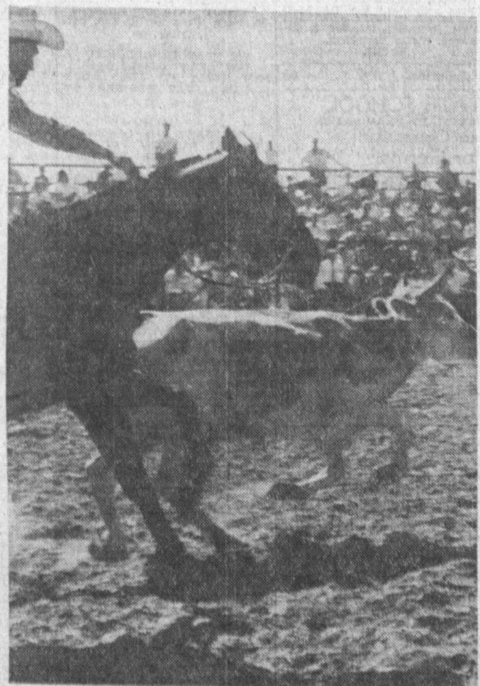
FLEEING STEER is about to be corralled by daring rodeo performer as near-filled stands watch second day of annual event staged at Del Amo Shopping Center field. Five days of fun featured booths, carnivals, games and two days of hot-shot riding and steer wrestling. Top performers in nation appeared here.