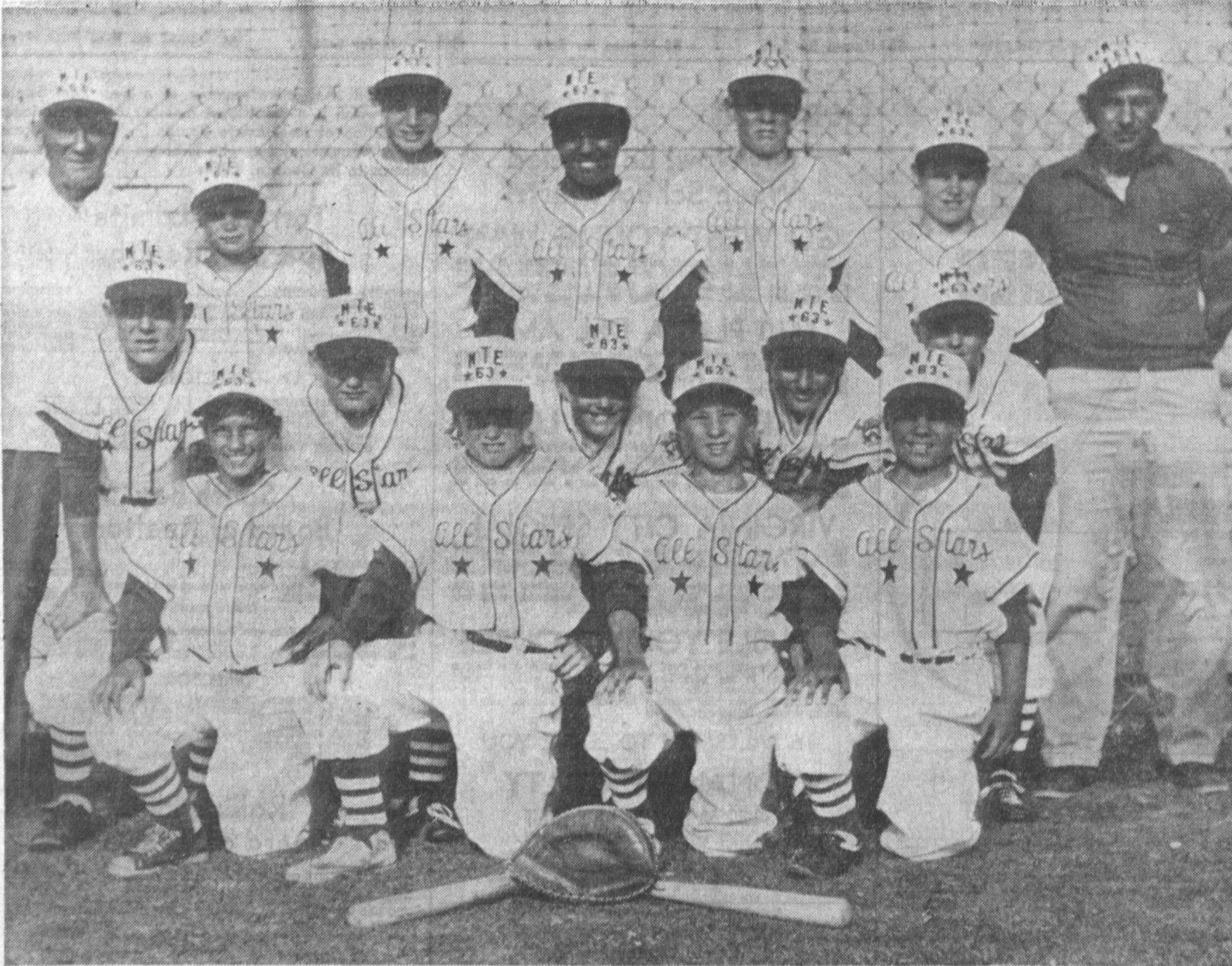
NORTH TORRANCE EAST LITTLE LEAGUE ALL-STARS