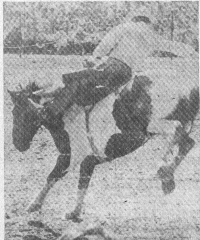
SADDLE BRONC riding exhibition by this cowhand was one of features of RCA rodeo which wound up this month's annual Rancharo Days fete here co-sponsored by the Torrance Junior Chamber of Commerce and the Torrance Mounted Police Assn.