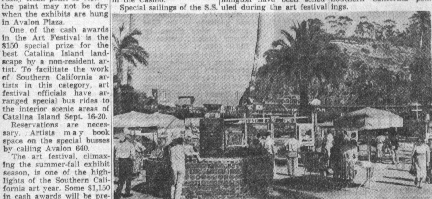
OPEN AIR GALLERY - This picturesque street scene will be repeated Sept. 21 and 22 when the Catalina

Sept. 21-22 Catalina Island A dinner honoring contest Steamship Co. dock at the patrons who regularly visit art festival will present a judges will be held Sept. 21 foot of Avalon Blvd. in Wil-the island for the exhibit of mington have been sched-Southern California paint-