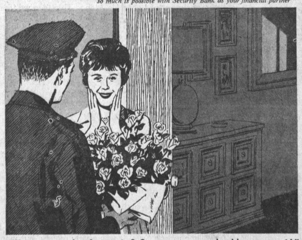
"Want to receive bouquets? Open your own checking account!"

so much is possible with Security Bank as your financial partner