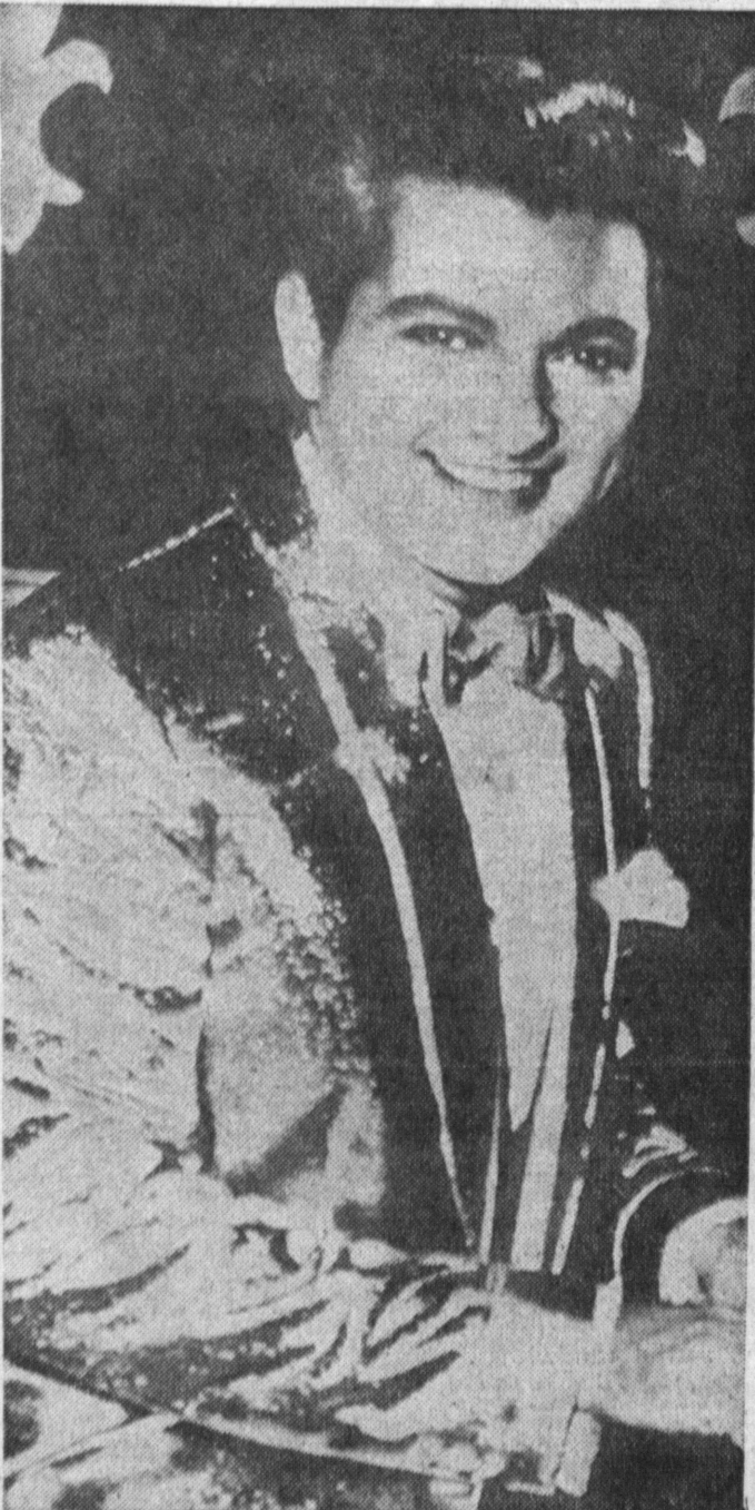
LIBERACE of course, his piano, his smile and can-delabra will be coming to the Melodyland Theatre in Anaheim for a one-night concert on August 19. His appearance will come between the showing of "Gypsy", which plays Aug. 13 to 25. Tickets on sale Monday, Aug. 12 at the box office, an mutual agencies.