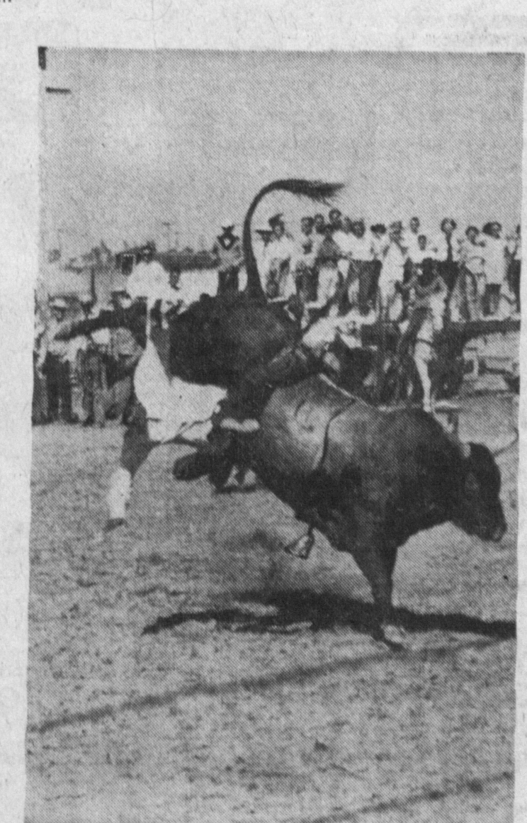
BUCKING STEER gives local rider rough time in RCA Rodeo in past Ranchero Days activity here. This year more of the same and lots of new, interesting action is promised by the Torrance mounted police and the Torrance Junior Chamber of Commerce.