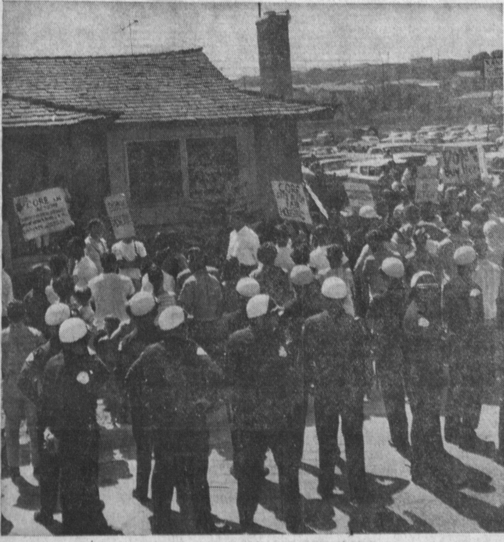
ON THE PORCH of home at Anza-Calle Mayor entrance to Southwood tract, CORE demonstrators hold up