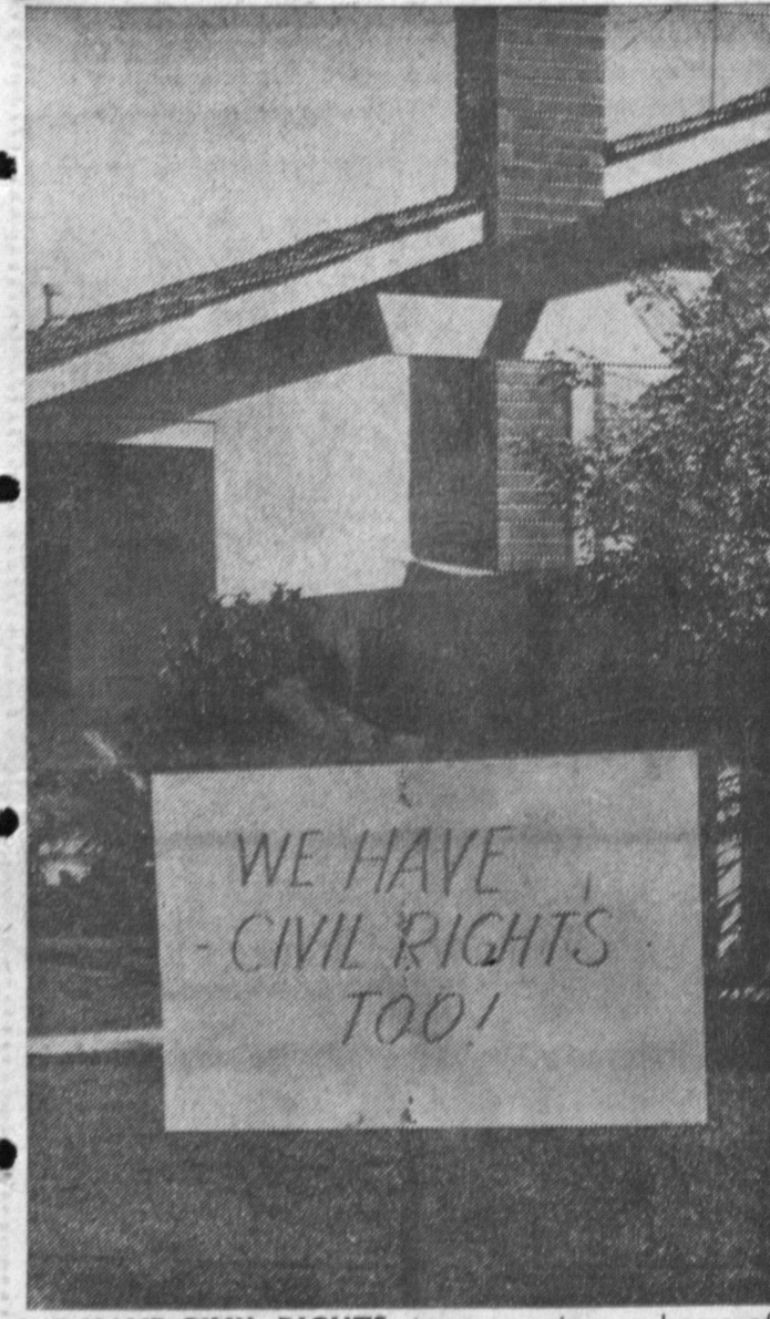
WE HAVE CIVIL RIGHTS, too, says sign on home of Southwood resident during march Saturday by racial

Our subscription rates will remain the same — but our deadlines for the Friday paper will of necessity be moved up to Thursday noon for advertisers and Wednesday noon for publicity and news copy.