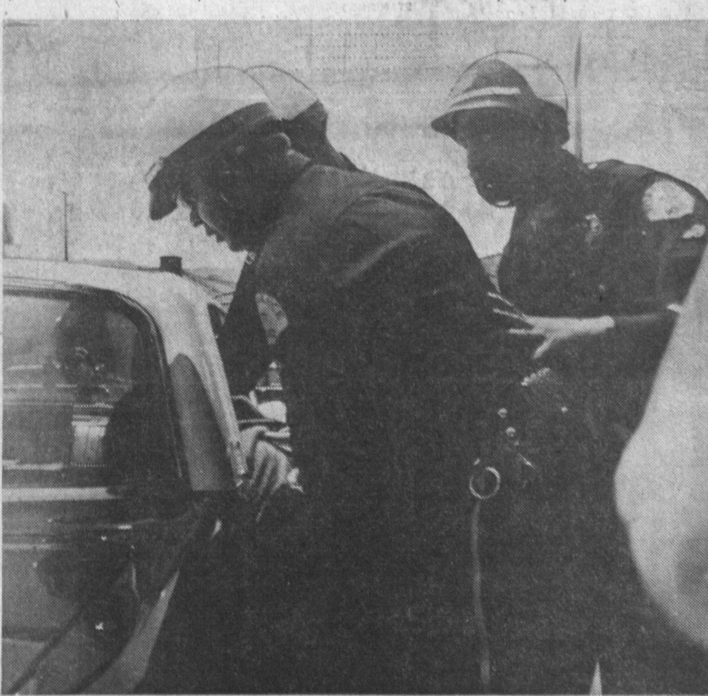
TORRANCE POLICE place unidentified picketer in police car Sunday as