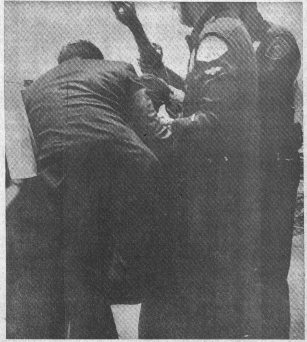
NEGRO PICKETER arrested for trespass raises arm in protest as he's