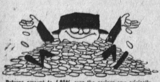
Returns amount to 4.88% over the savings you originally invested the previous April.

Come March 31, 1964 - figure the result.