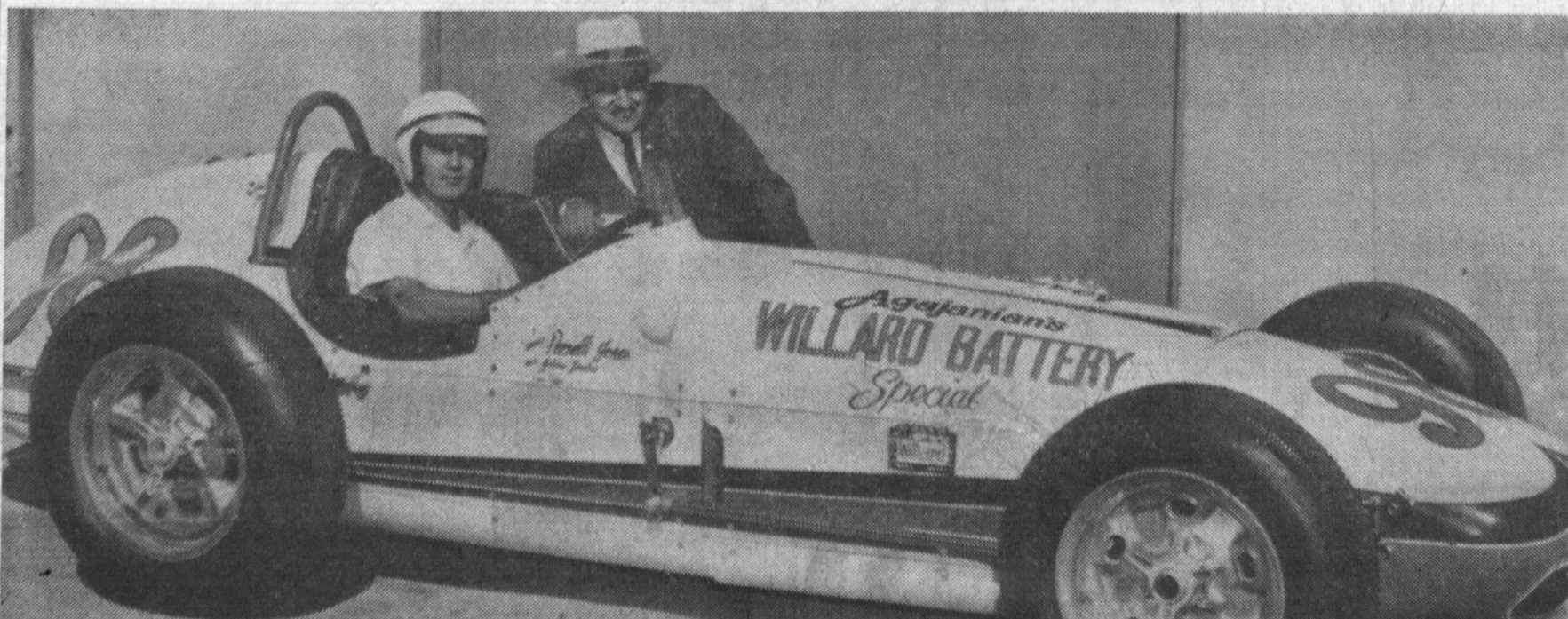
ON THE POLE —Parnelli Jones, shown at wheel of Agajanian Willard Battery Special, discusses tomorrow's Indianapolis 500 mile race with owner J. C. Agajanian. Jones, of Torrance, won the pole position for the second straight year with a record speed of 151.153 mph. Jones was leading the big Memorial Day race last year when he ran into car trouble and had to quit.