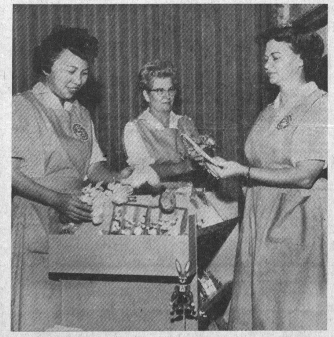
PRESENTING GIFT CART to Torrance Memorial Hospital are members of the Women's Auxiliary. Available to visitors, personnel and hospital patients, the cart contains greeting cards, baby gifts, boutique items and