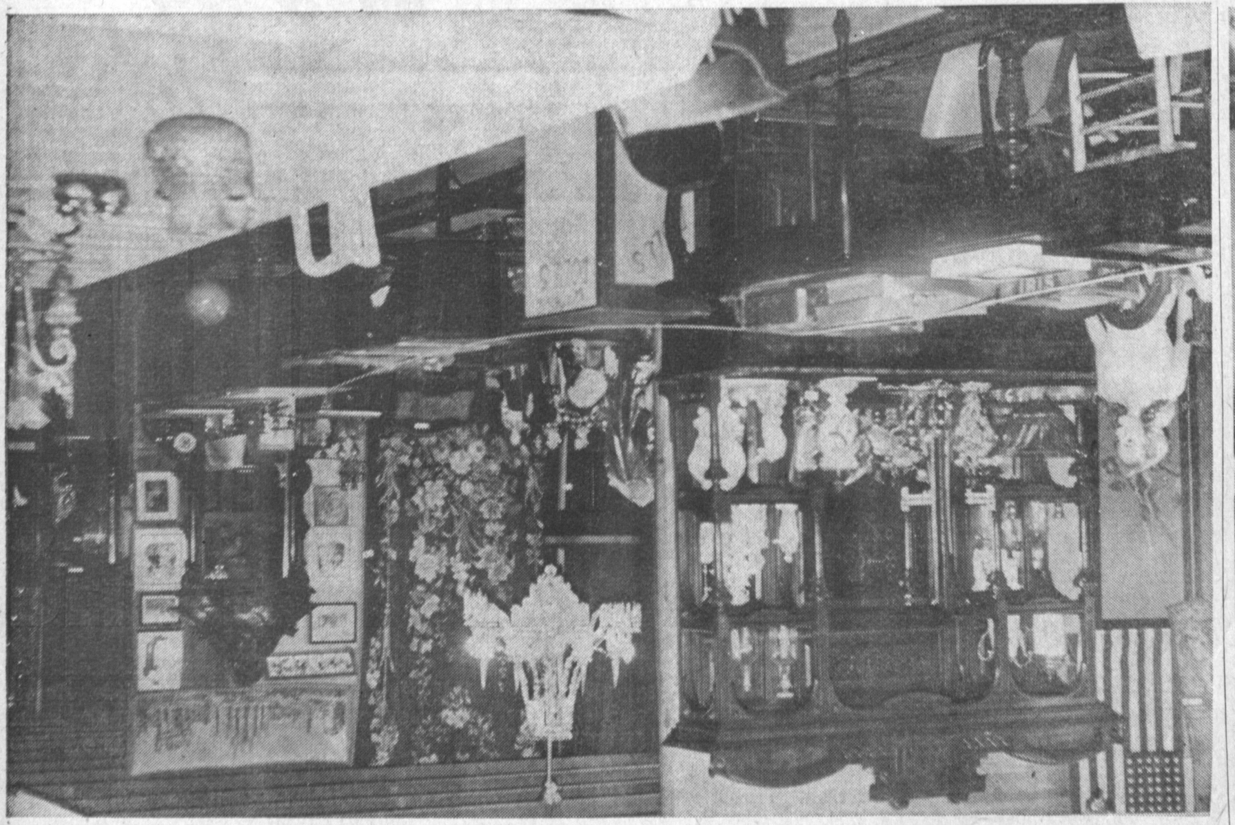
AN INTERIOR VIEW of the Kuska Museum on Walnut Street in Lomita shows a small section of the two room building which houses over 20,000 pieces of antique furniture, glassware, buttons, silver, gems, coins, campaign buttons, dresses, and over 1,000 dolls. Mrs.