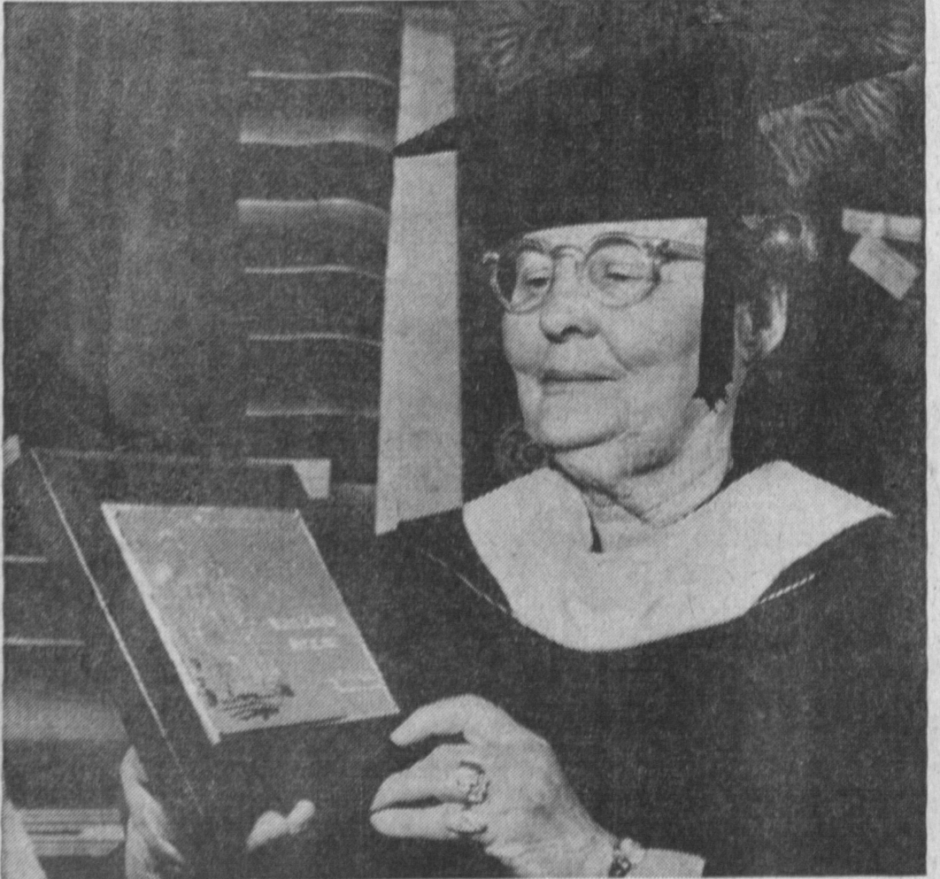
Fort Hayes (Kansas) State College, hon- of American history. ored her with a distinguished achieve-