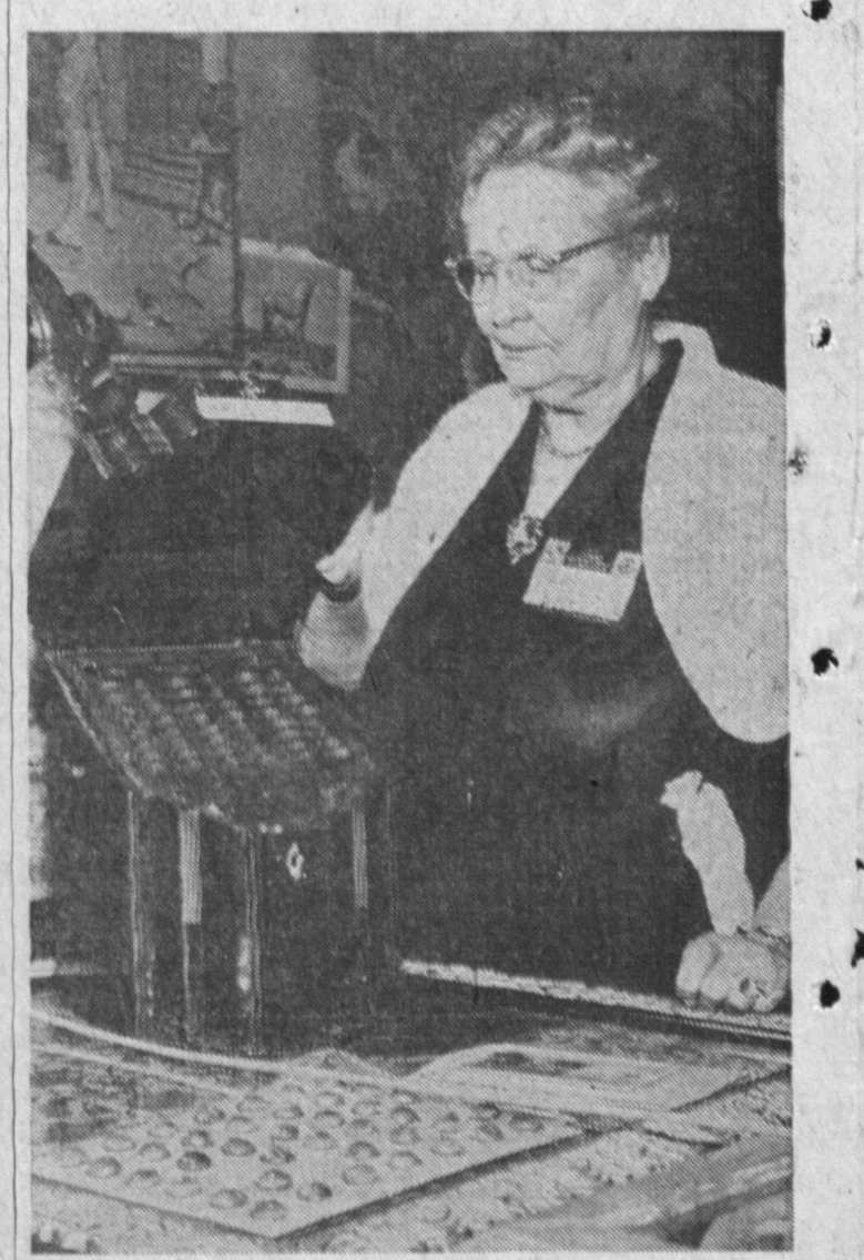
IN 1700 FAMILIES would place their silver in a chest like the Hepplewhite knife box above; and take it to their bedrooms at night to prevent the servants from running off with the valuable silver.