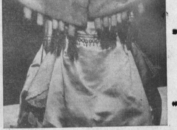
A NECKLACE of 37 jewels each containing a miniature reproduction of a famous painting in the Louvre, highlight a rare French doll, the only one in the world, and made in 1899. The doll wears a real ermine cape over a handmade lace and satin dress.