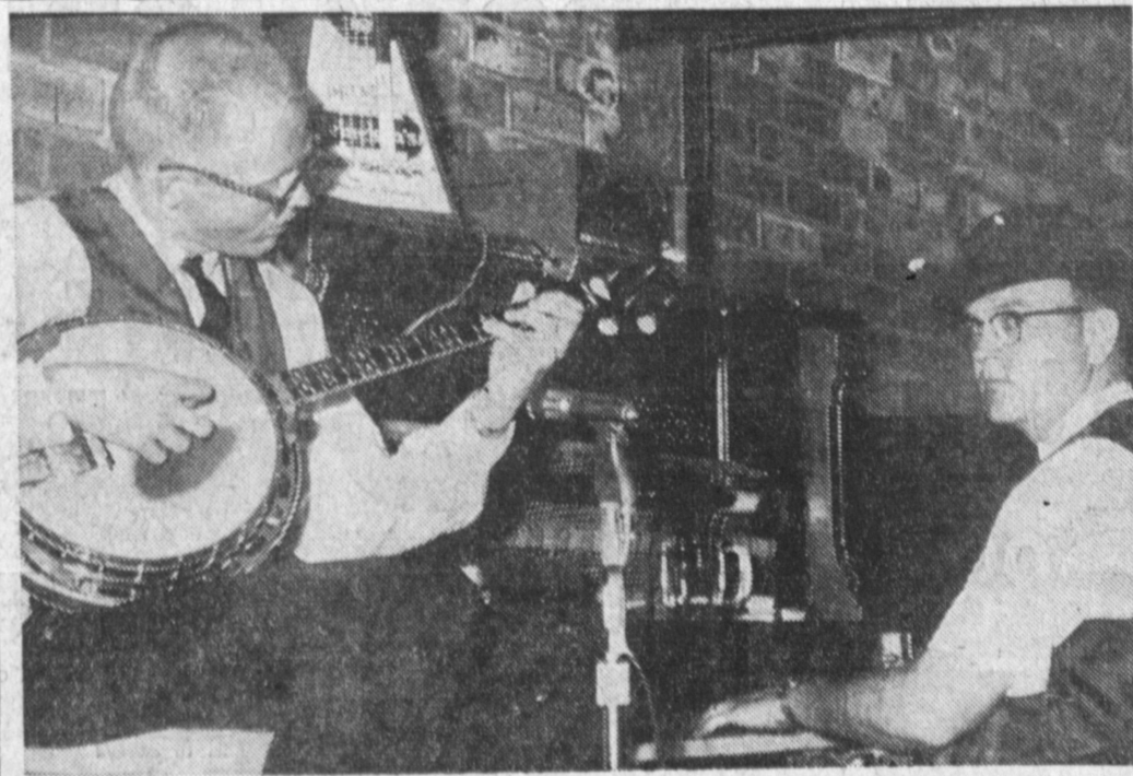
The world famous Knuckelbusters every Sunday, Friday and Saturday nights play for your enjoyment at the