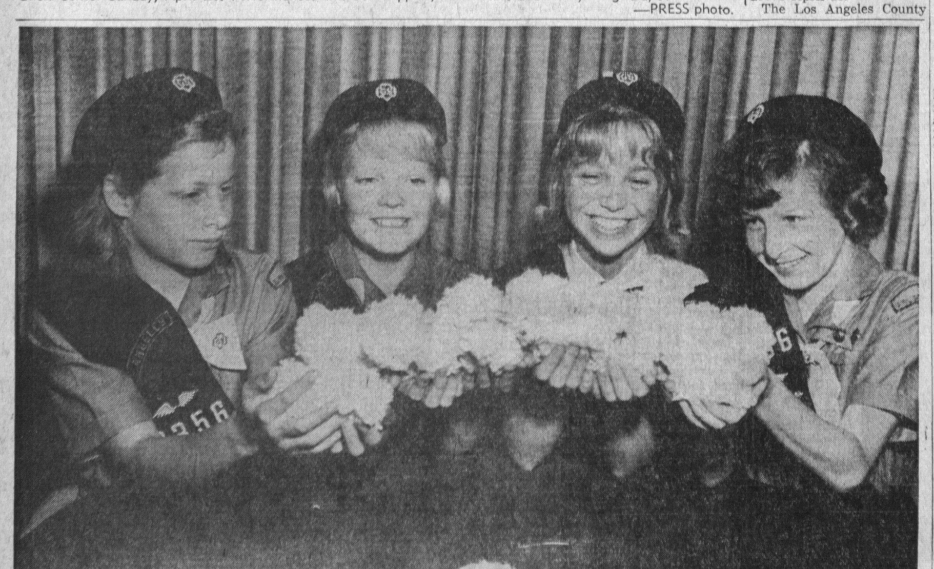
PAPER POSIES are prepared by members of Girl Scout Troop 2356 to brighten buffet table at spaghetti supper to be held at Higgins Brick Yard patio next month. Proceeds of the event, set for 1 to 5