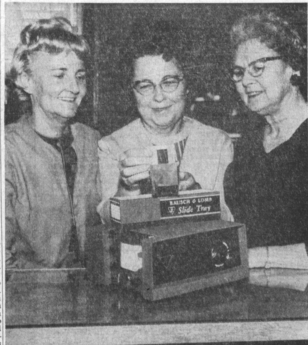
PRESENTING PROJECTOR to the Y.W.C.A., as its philanthropy project for this year are members of the Torrance Woman's Club. Sound projector, slide projector and screen will be used by community groups that meet at the

The Indiana state picnic will be held in Sycamore Grove April 28.