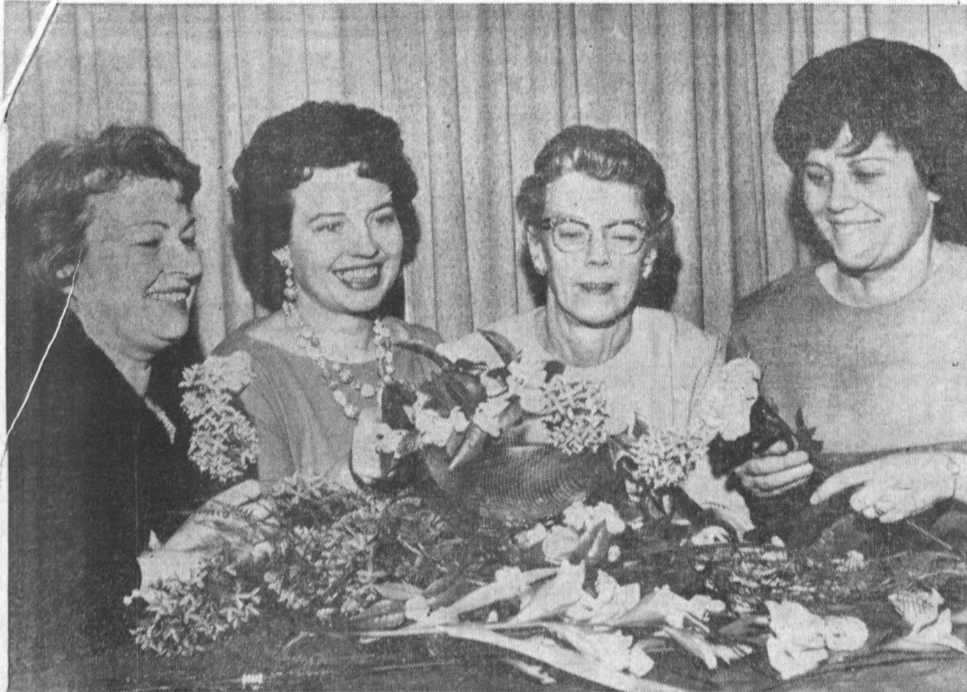
EIGHTEENTH ANNIVERSARY of Court St. Catherine 1378, Catholic Daughters of America, will be observed Sunday. Following holy communion at 11 a.m., mass at Nativity Catholic Church, members of the court will observe the occasion at luncheon at the Polynesian Res-