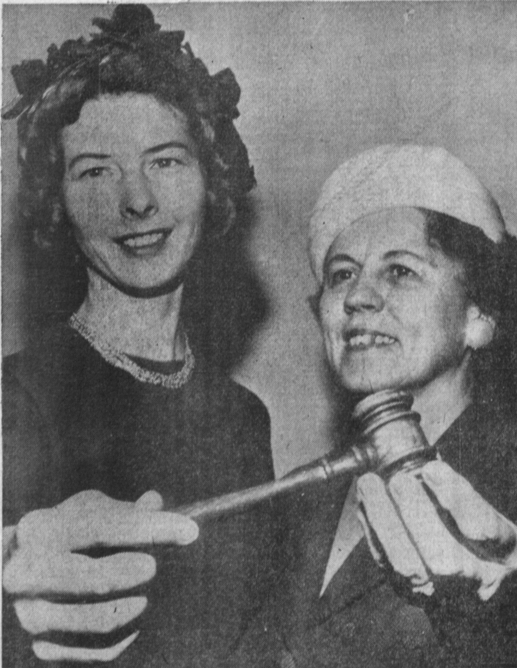
PASSING OF GAVEL highlighted installation ceremonies of Torrance Memorial Hospital Auxiliary Tuesday. Setting for that luncheon was La-Venta Inn, Palos Verdes Estates. Pic-