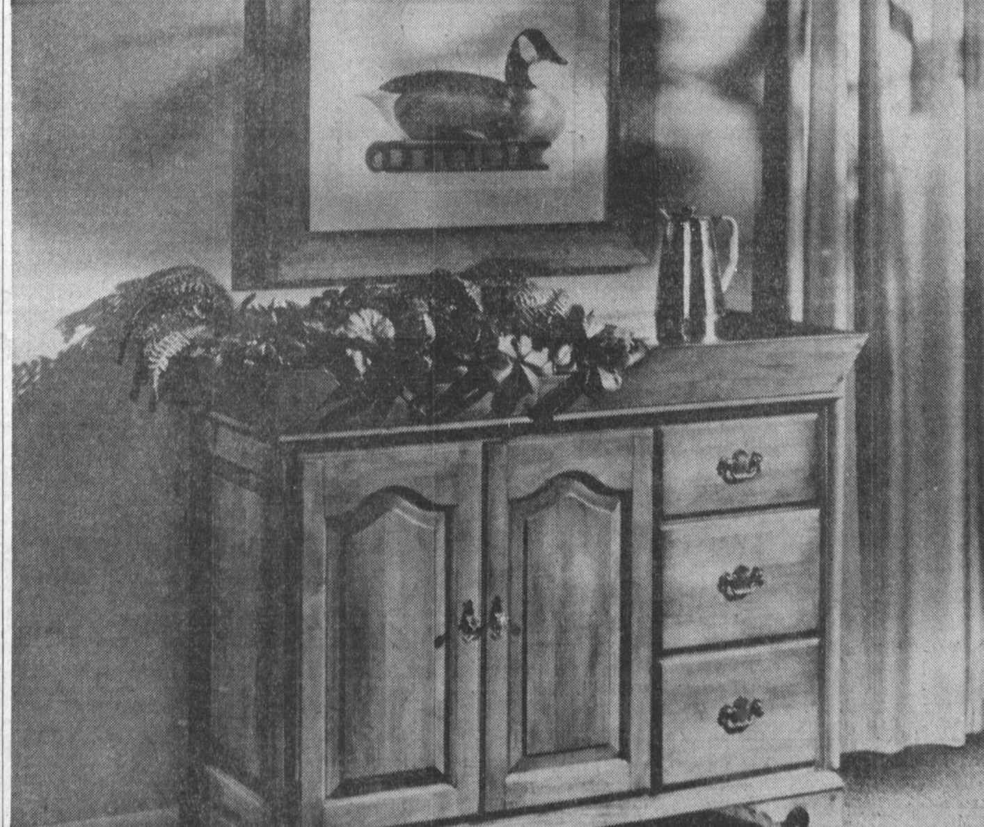
OUR ANCESTORS probably never dreamed a TV might tees of Americana probably will thoroughly appreciate be housed in the cabinet section of a dry sink. Devo- the opportunity of this mellow maple adaptation.

you may lift and divide them. When you do, do it in