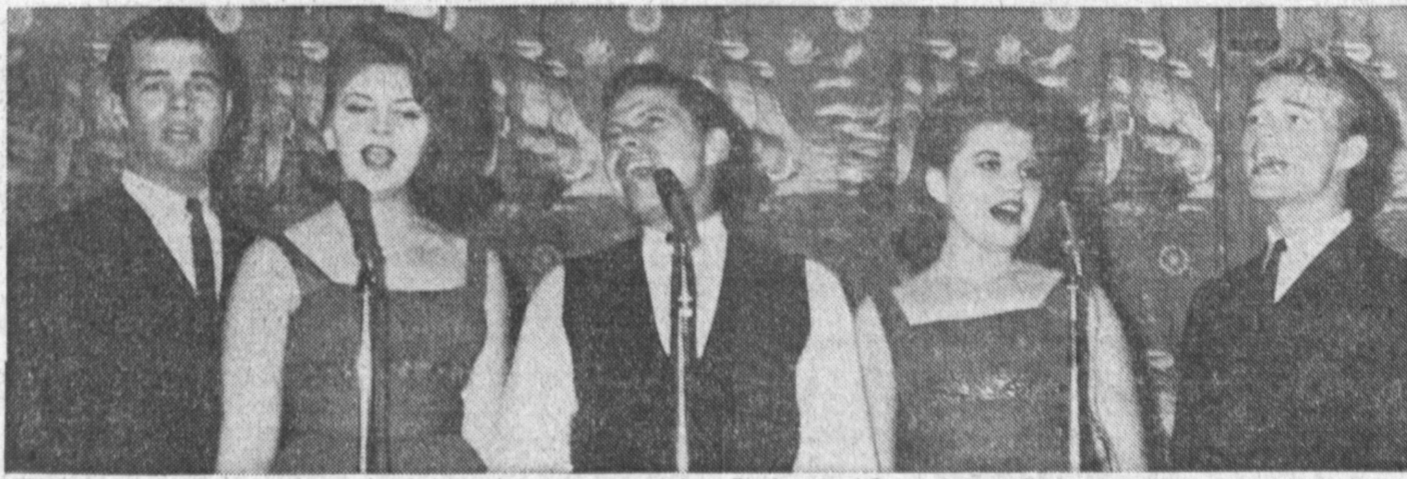
THE MARINER sets you rockin' with the upstarts styling of old and new melodies. Wednesday, Thursday, Friday and Saturday nights.

The CHICKEN PLUCKERS OPEN this week coming — all of everything and everybody should be there to get in on the ground floor of what will be one of the happiest Chicken Dinners you may ever eat — lousy english but wonderful food. That's it for this week. Don't forget to get and use Easter Seals.